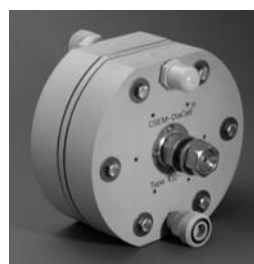
Figure 2: DiaCell® configuration 101

The simple DiaCell® electrolysis allows a good prevention against Legionella contamination for potable water for closed systems continuously treated. DiaCell® can be used to disinfect potable water contaminated by Legionella (4.10 4 Cfu/mL). A remarkable inactivation is already observed after 5 minutes contact time. A low level of disinfectant (< 1 ppm) is sufficient to rapidly sanitize a distribution system. Then, a continuous low level of disinfectant (0.1 – 0.2 ppm) can keep this system disinfected.