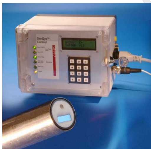
Figure 1: View of transmitter with sensor head

A compact robust electronic interface based on the existing CSEM miniaturized potentiostat was developed to allow field-testing of the sensor. Figure 1 shows a view of the interface. The system was easy to operate. A 4 to 20 mA analogue output was available for process control and up to 30'000 stored data-points could be retrieved through a RS 232 interfaces.